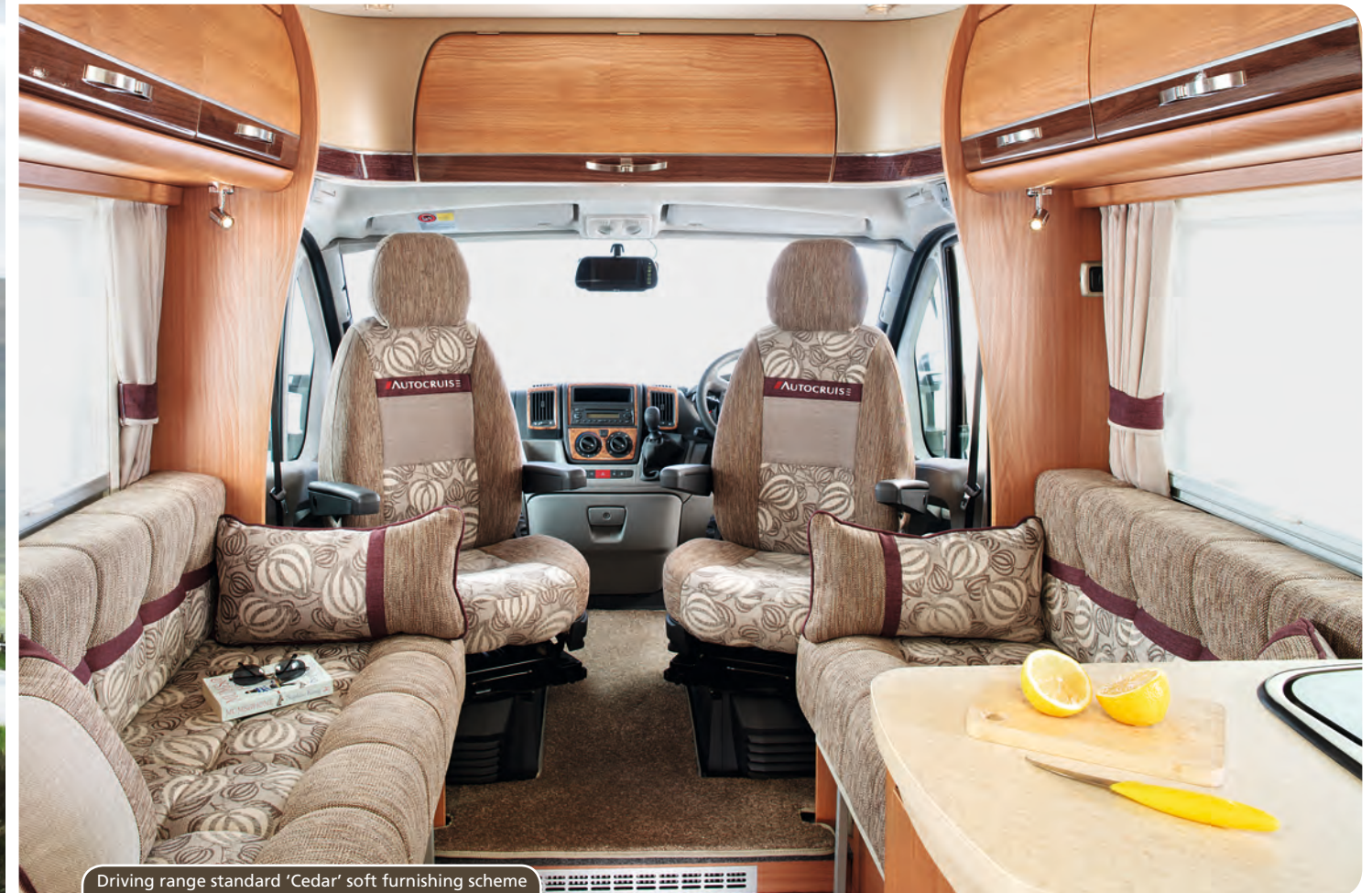
Driving range standard 'Cedar' soft furnishing scheme