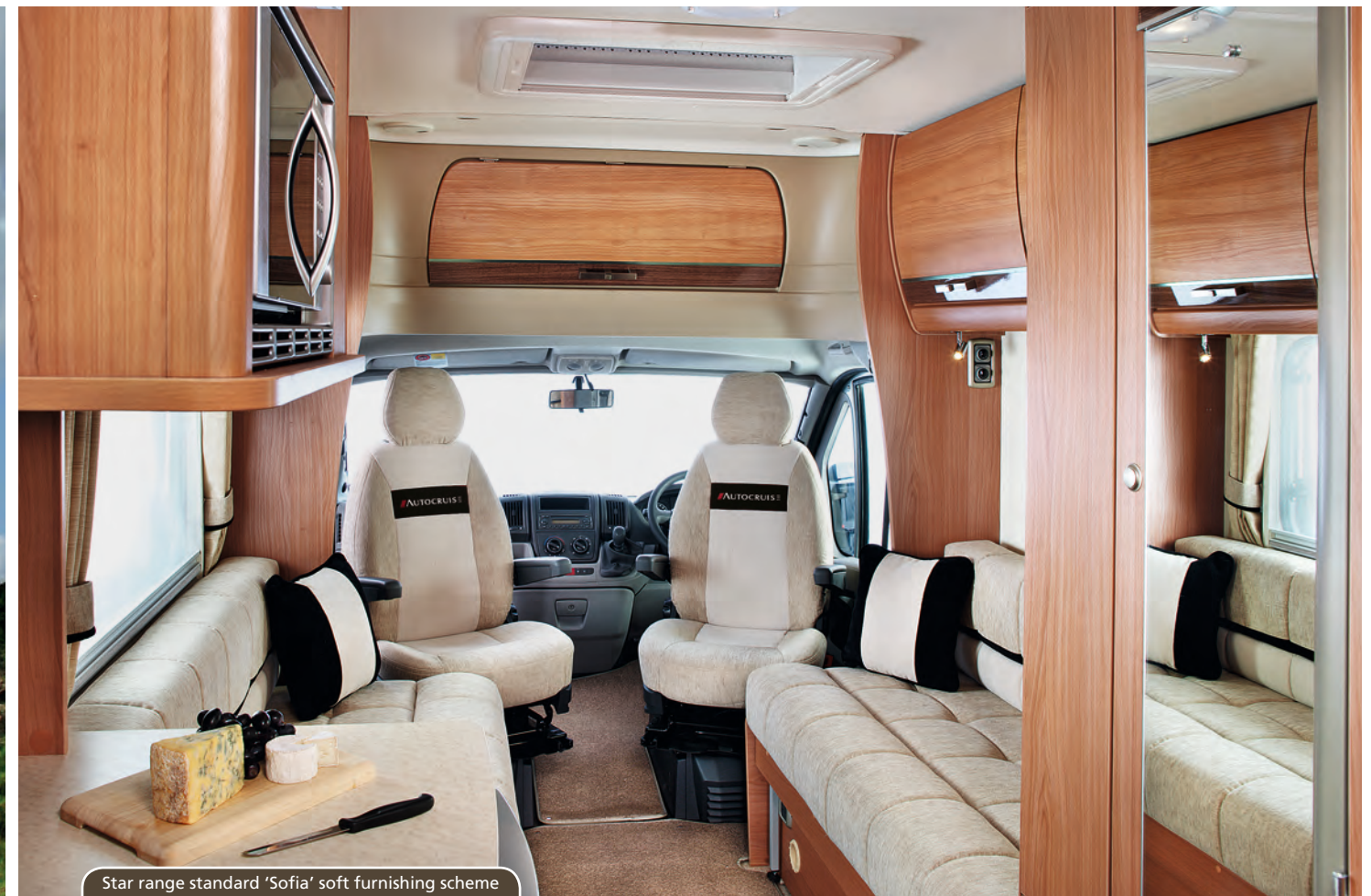
Star range standard 'Sofia' soft furnishing scheme